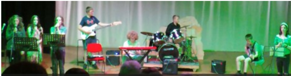
Two photos from the SUMMER SHOWCASE!