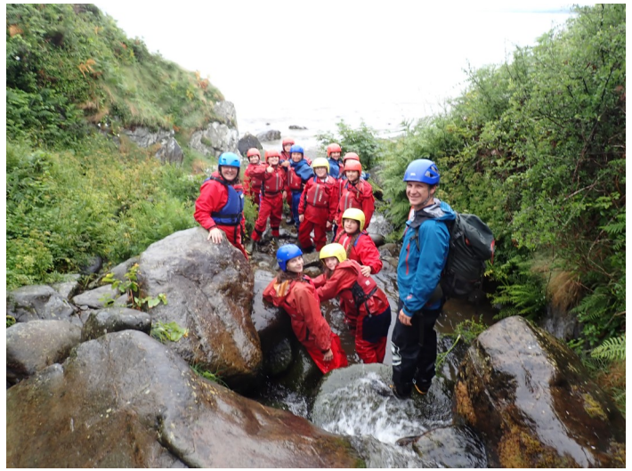
Two photos from Arthog!