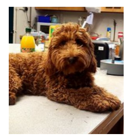
Mr Wilko—school therapy dog